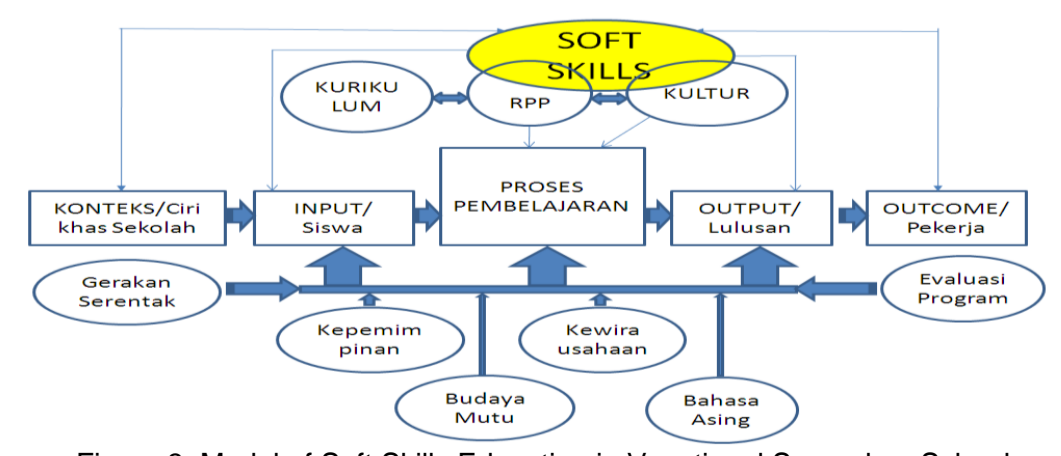
Figure 3. Model of Soft Skills Education in Vocational Secondary School